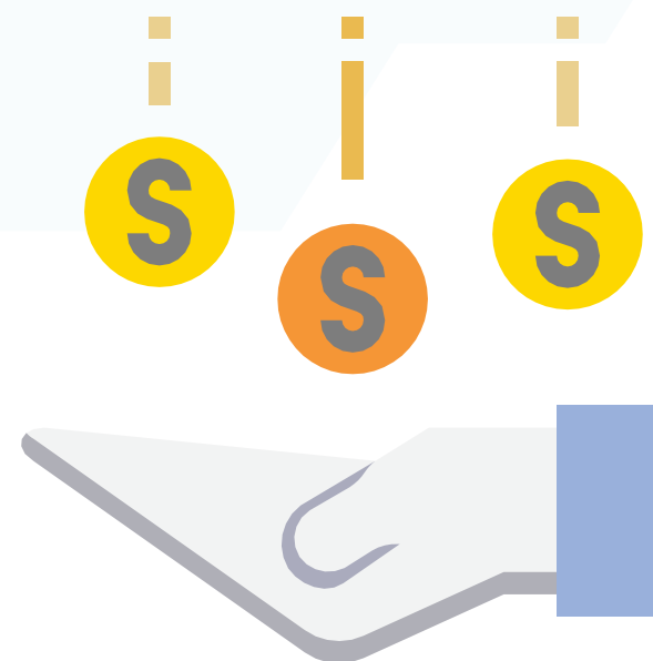
Benefits to connect